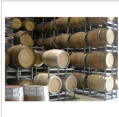
2010 Vintage—all progressing well

I love the 2010 Eden Valley Riesling to drink now or put a dozen or two away for future enjoyment—it won't disappoint. The new 2010 Adelaide Hills Sauvignon Blanc is now available. The intense aromas of passionfruit, citrus and fresh tropical fruits make your mouth water before you even sip it. This leads to a wonderful lingering and zesty palate. One to enjoy! And remember that we sold out of the 2009 six weeks after opening the cellar door. So get it early before the 2010 sells out too.