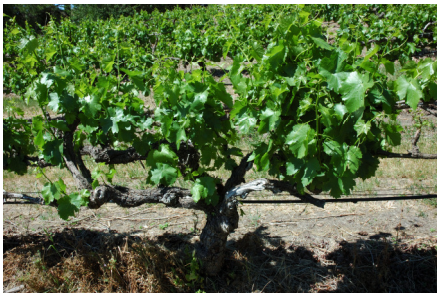
80+ year old Grenache vine— November 2010

Our current releases have won 21 medals between them plus other awards so you can be very confident of our continued exciting releases.